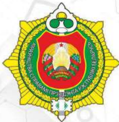
Belarus President Property Management Directorate