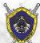
Investigative Committee of the Republic of Belarus