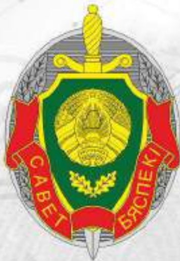
State Secretariat of the Security Council of the Republic of Belarus