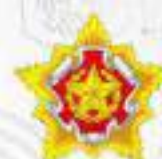
Ministry of Defense of the Republic of Belarus